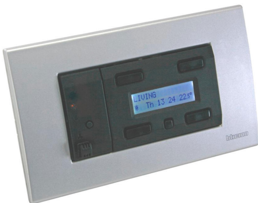
VMB1TC, Shown with sensor in a Bticino* frame. (* not sold by Velleman)