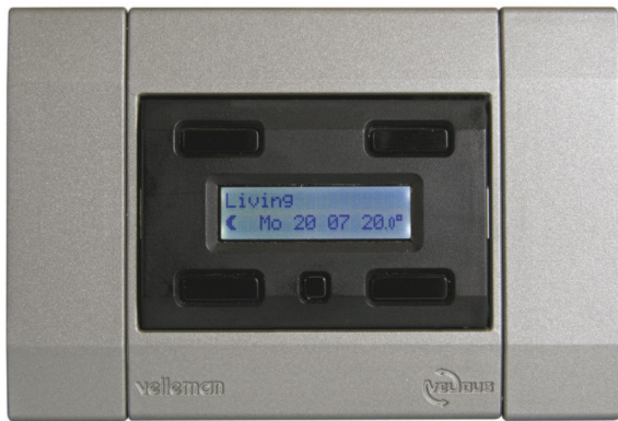
VMB1TC, Shown with optional frame VMBFLG