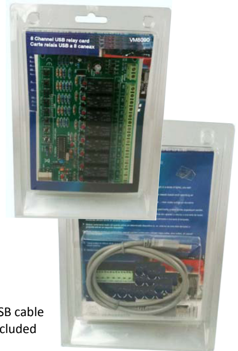
USB cable included