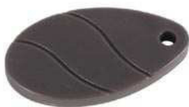
Extra badge: HAA86C/TAG2