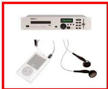
CD player MP3 player...