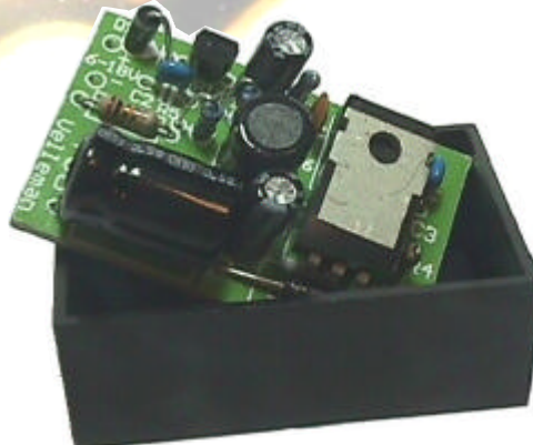
Includes "potting" enclosure