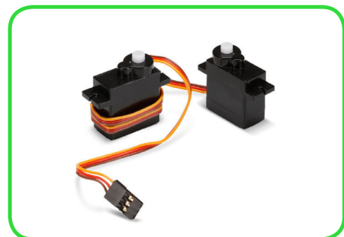
9G SERVO MOTORS (VR006)