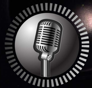
On board microphone

The K8094 allows you to record and play messages of up to 8 minutes long. Recording speed is continuously adjustable so that you can choose a perfect compromise between duration and sound quality. It also allows you to generate funny sound effects. Messages are retained in memory at power loss. The unit comes complete with microphone, line level in- and output and an output for a small speaker.