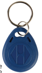
optional access badge part # HAA2866/TAG2