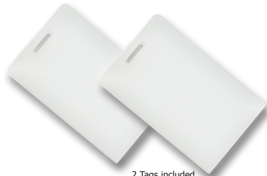
2 Tags included part # HAA2866/TAG