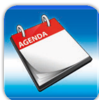
Programmable week timer