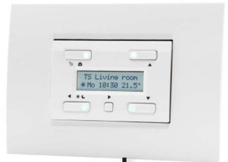
Bticino® frame not included.