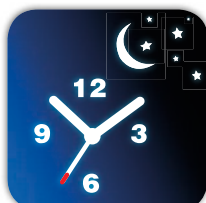
Programmable sleep timer