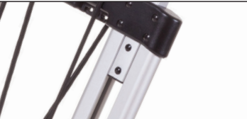
FXWT-706: Double Tube Frame