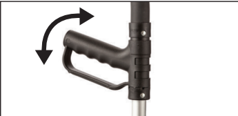
FXWT-707: Adjustable Grip