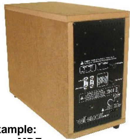
Example: 18mm MDF