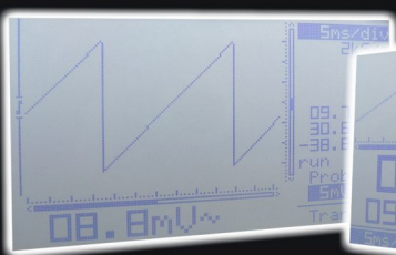
Normal screen with large DVM